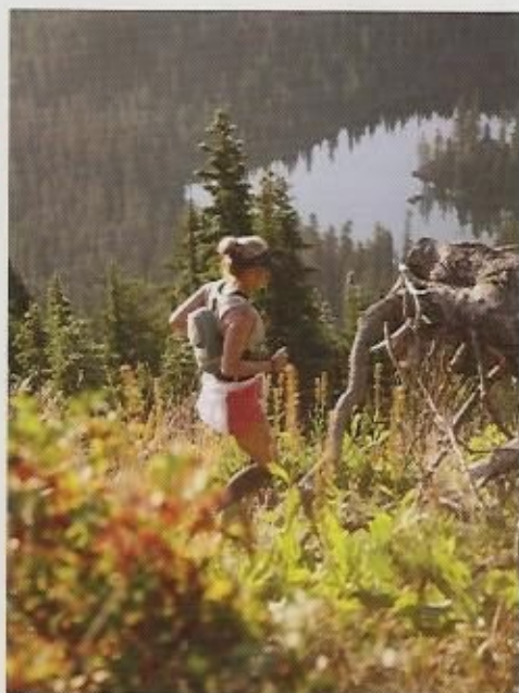
Welcome downhill near Thorpe Lake