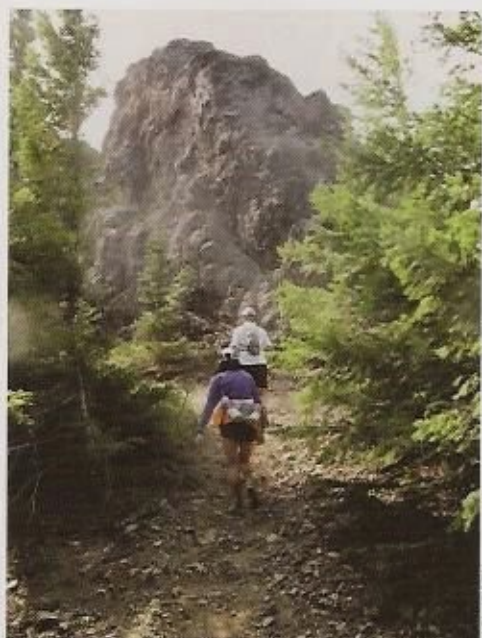
Climbing Goat Peak to earn a great view